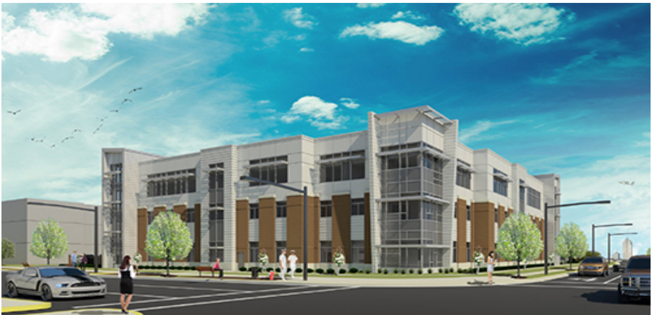
Virginia Beach Housing Resource Center