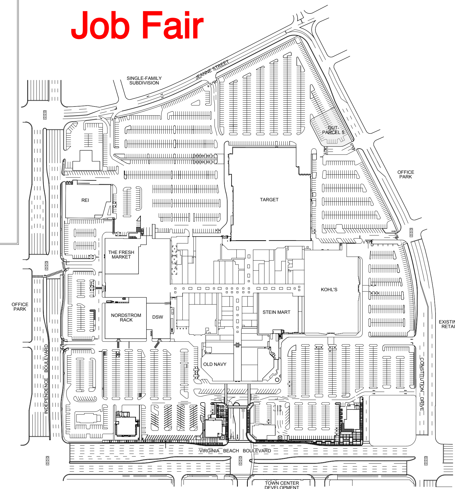
PEMBROKE MALL KEY PLAN - NOT TO SCALE