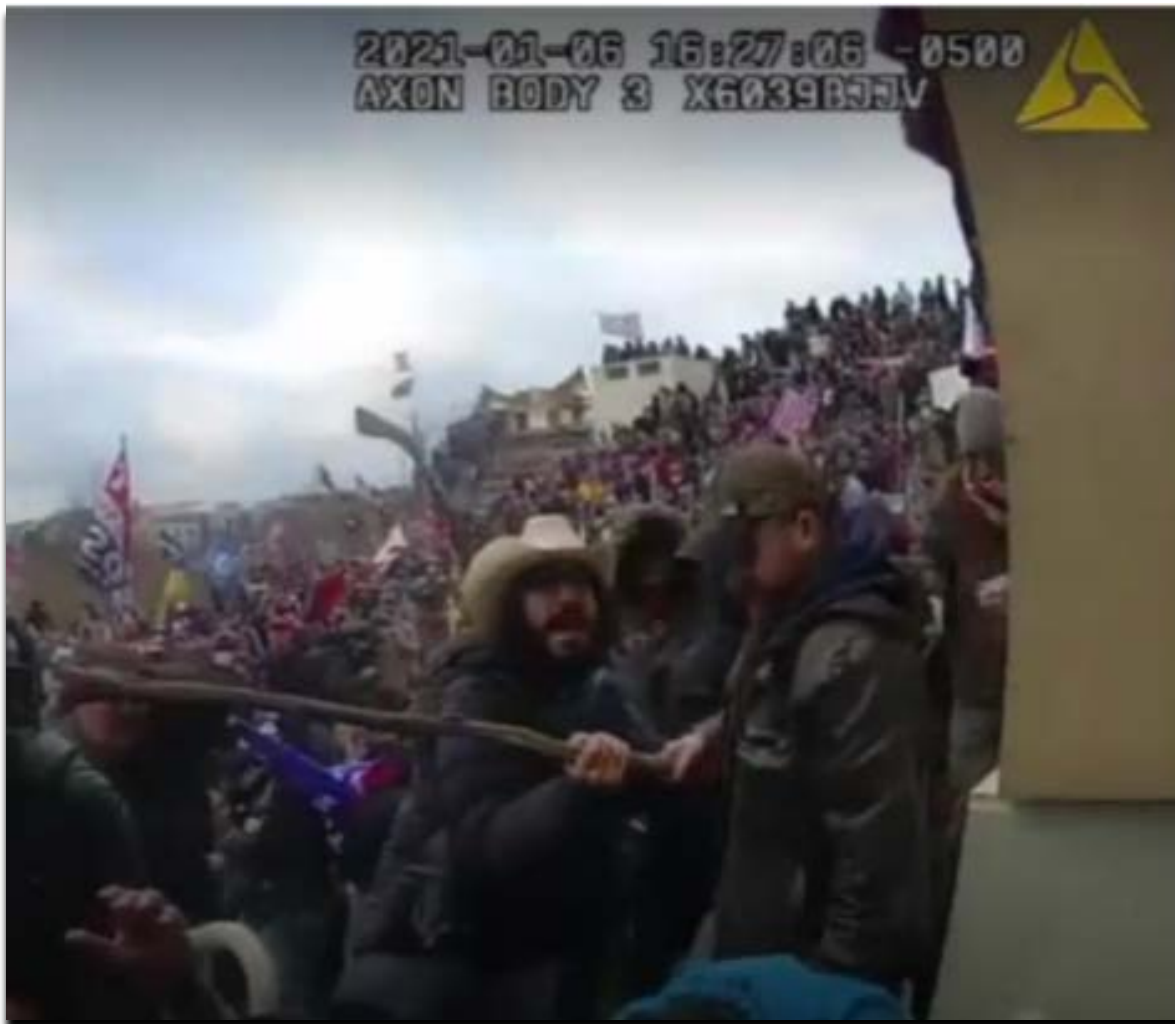
MELLIS Assault Image 2 (Striking / Stabbing at Officers with blunt weapon):