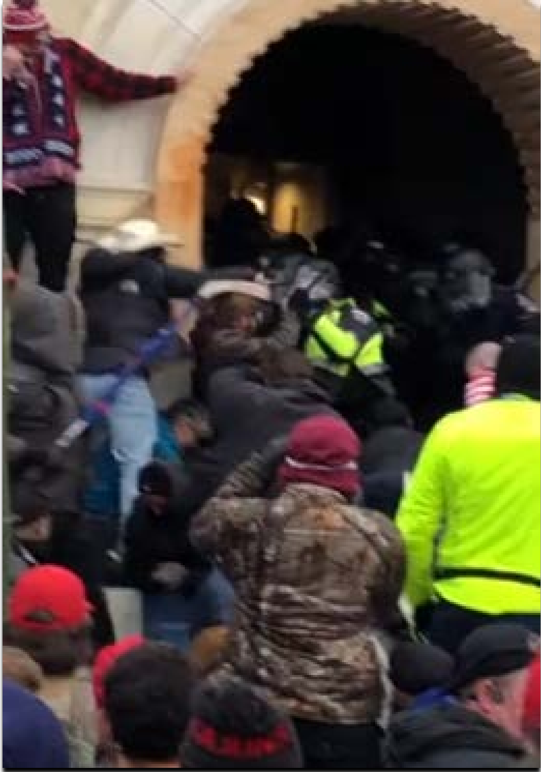
MELLIS Assault Image 3 (Striking / Stabbing at Officers with blunt weapon):