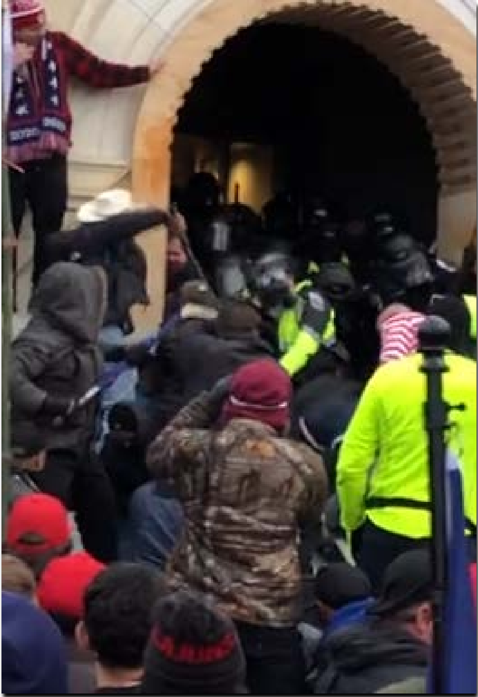
MELLIS Assault Image 3 (Striking / Stabbing at Officer's neck):